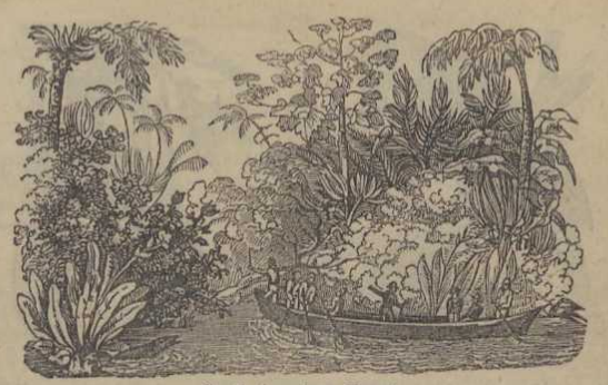
South American Forest.

7. The forests of many parts of South America exhibit a luxuriance and diversity of aspect different from those of most other parts of the world. They are enlivened by a great variety of birds of singular forms and superb plumage, which flutter through the branches; and troops of monkeys and squirrels, that leap from bough to bough; while the occasional appearance of the alligator, with numerous serpents and lizards, presents a singular and varied scene.