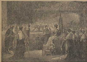
CORONATION OF QUEEN VICTORIA.

A. A government in which the power of the ruler is limited by fixed laws.