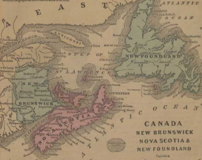
See Longitude West from Greenwich on Atlantic Ocean Geographical and Political Statistics of the Dominion ATLANTIC OCEAN NEWFOUNDLAND GULF OF ST. LAWRENCE CANADA NEW BRUNSWICK NOVA SCOTIA & NEW FOUNDLAND

H B M A S Y U S A M P A C A B S A R A L U S M A M S A H C A E C M R L A S P P M S M A H B A C A S R L A J a n u a r y a b o v e H C A D A H G A D C A M S A P O R M P A