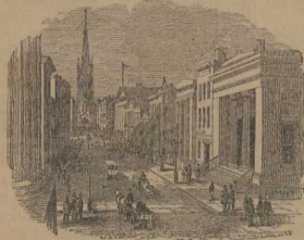
VIEW IN WALL STREET.

1. NEW YORK is the most populous state in the Union; it is celebrated for its wealth and prosperity, and is often called the "Empire State."