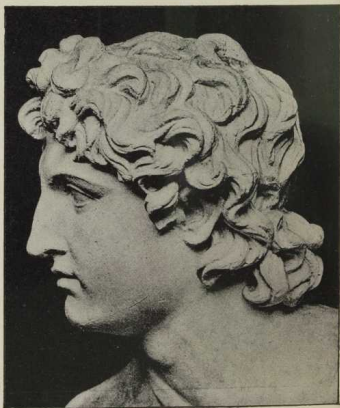
Fig. 103. Alexander, Kopf der Statue in München.