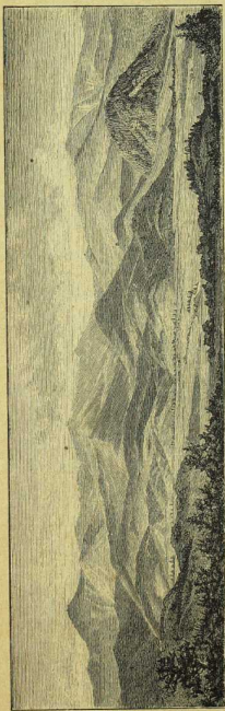
14. Das Riefengebirge.