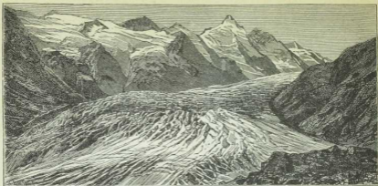
10. Gletscher: Paalitze am Großglockner.