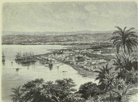
Port Durban in Natal. (Nach Photographie.)